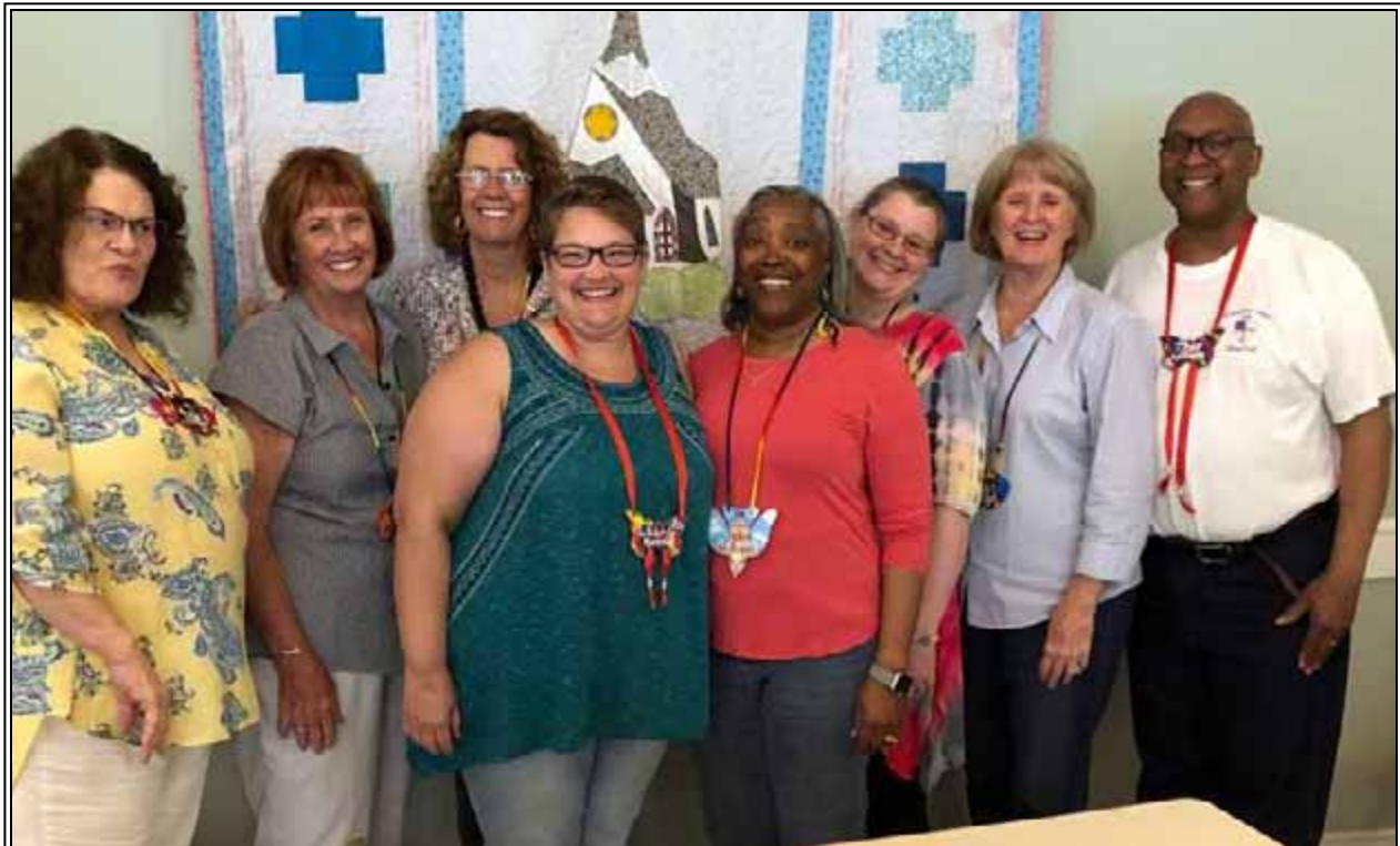
Members of St. Alban's Church attend Cursillo at St. John's Episcopal Church, Ocean Springs